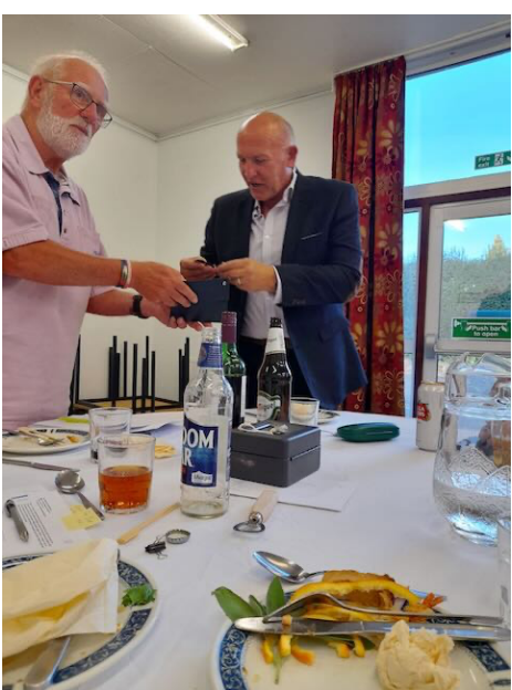
A casual meeting at the Victory Hall!

Our second meeeting was held on 16th August, again at The Bugle Hotel, in Titchfield.